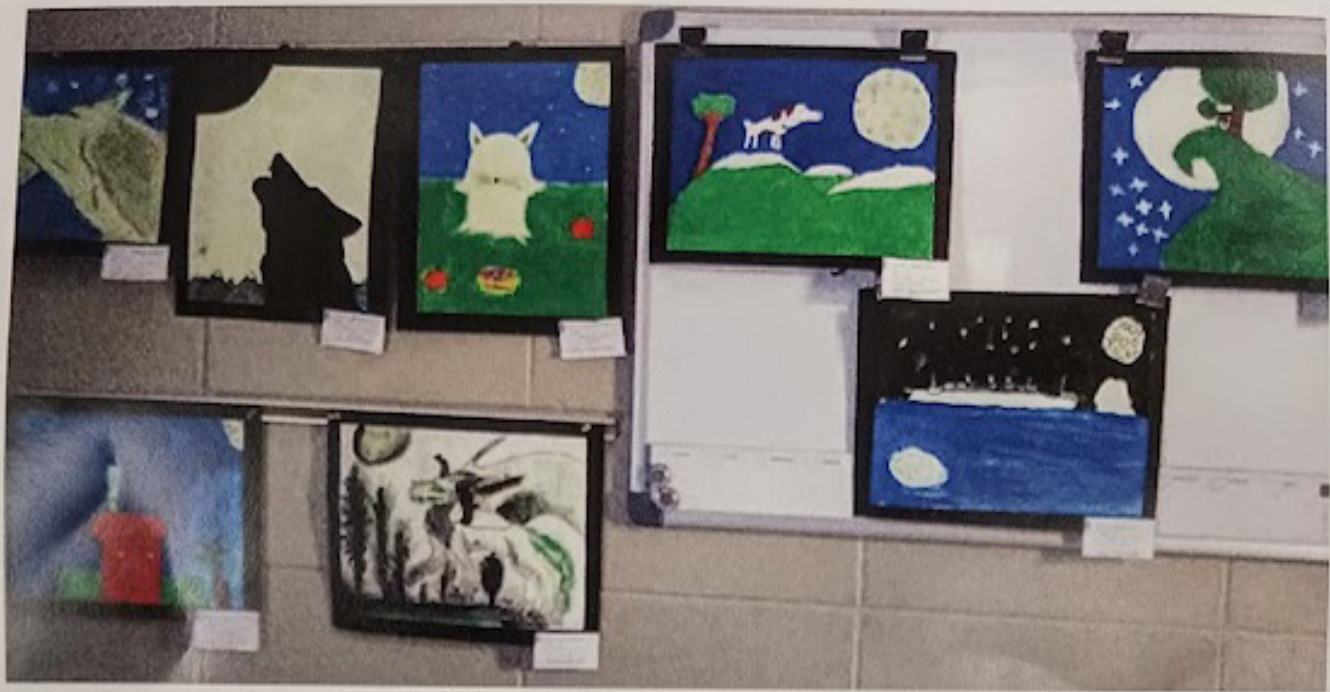
Psst. This was the secret display of glow-in-the-dark art in a secluded office at the ASD#4 Exhibit. Shhhhhh.