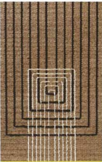
"Woven Line Study"