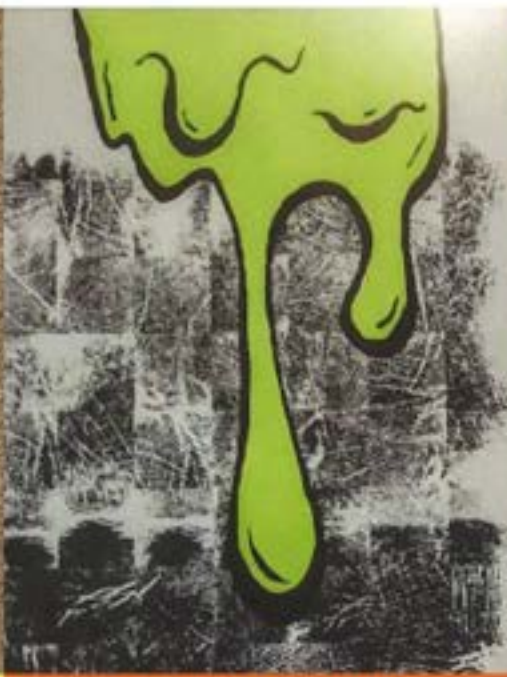
"Duo" (the green one)