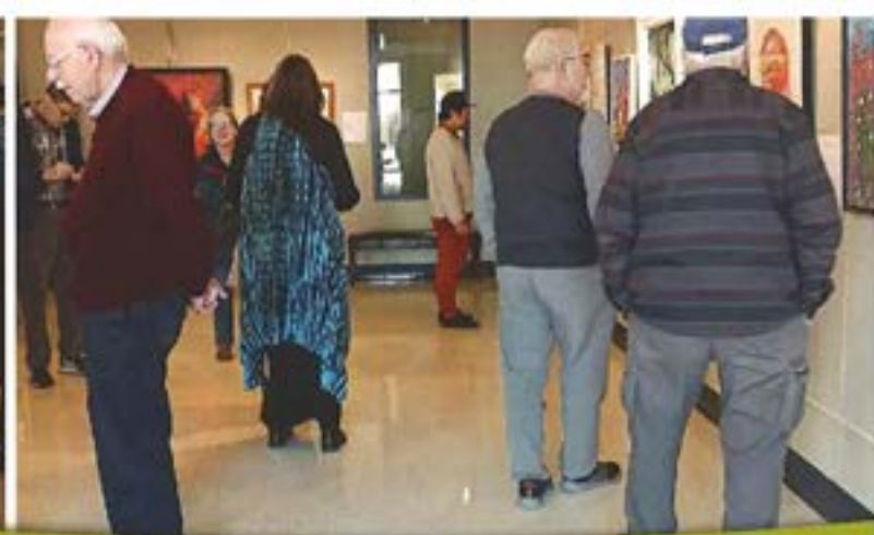
"Expressions" artists, poets, and gallery visitors are exploring the show.