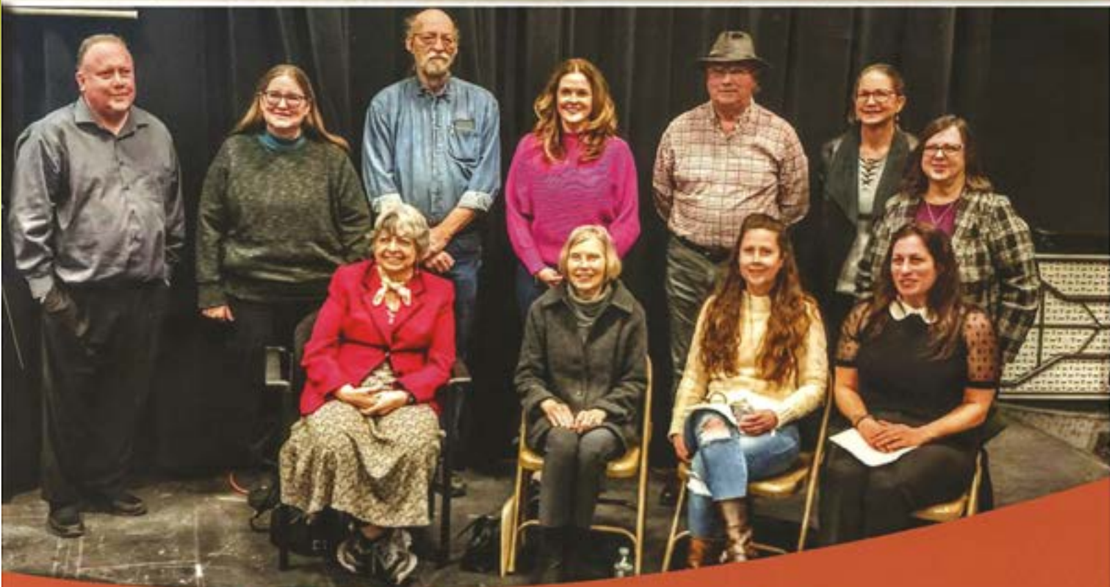
The members of the Illinois State Poetry Society are posing for a photo.