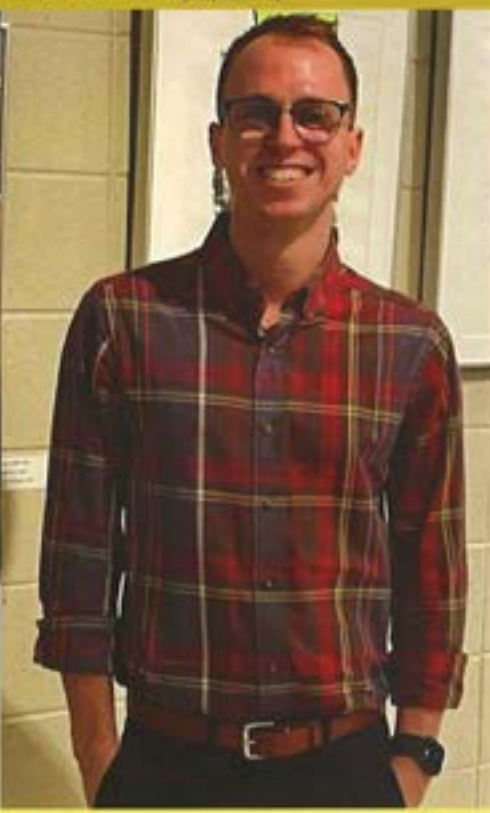
Artist's family and friends enjoyed the reception.