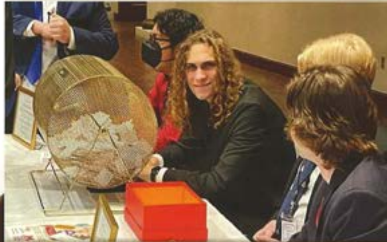
Volunteers at Mayor's Ball.