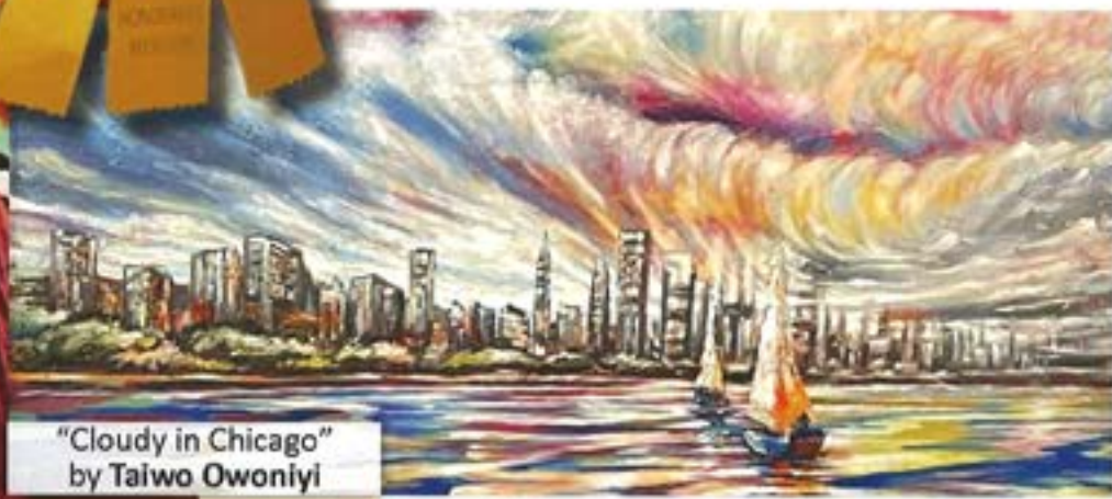
"Cloudy in Chicago" by Taiwo Owoniyi