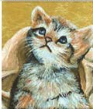
"Little Kitten" by Lyn Tietz