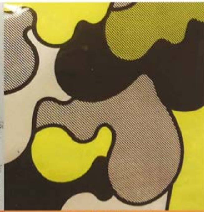
"Morph (Trini / Aisha)"